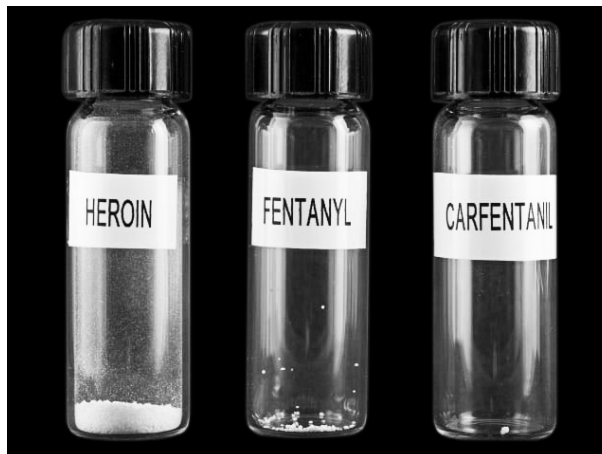
Amount of a FATAL OVERDOSE of either heroin, fentanyl, or carfentanil.