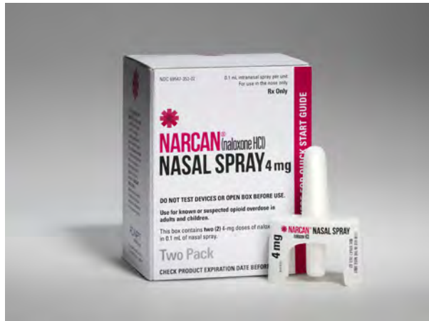
Naloxone (NARCAN®) SAVES LIVES after an opioid overdose.